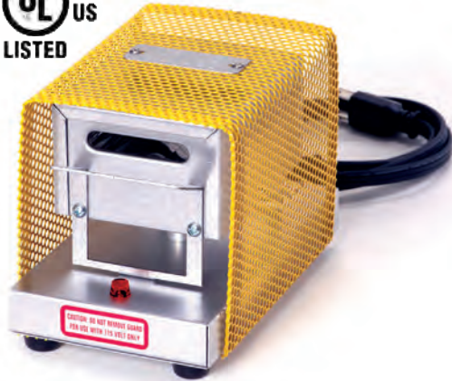
KPG/KPGT Heater (front)

Rear of the KPGT Heater, showing the standard open back end and the control for the optional thermostat, positioned in the back of the heater.